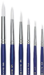
Blick Scholastic Short Handle Wonder White Brush Set - Round, Short Handle, Set of 6 close up

https://www.dickblick.com/products/blick-scholastic-wonder-white-brushes/?Item=05857-0059